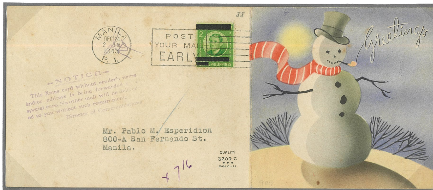
Dec. 24, 1943, Christmas Greeting Mail, Manila Circulating Franked with a provisional 2C stamp for proper 2C special discount rate.

2C special discount rate instead of 5C was applied to the mailing of Christmas Greetings for the period of December of 1942 and 1943 inside Manila. Also, sender's name and address could be omitted.