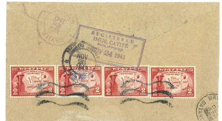
Copy of the Backside (60%)

Nov. 24, 1943, Single First Class Registered Mail, Imus, Cavite to Balayan, Batangas