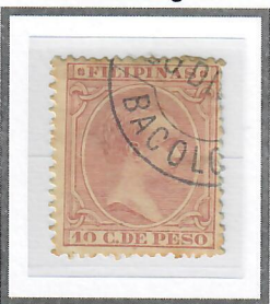
10c Pale Claret (1891) Cliché I – Scott #164