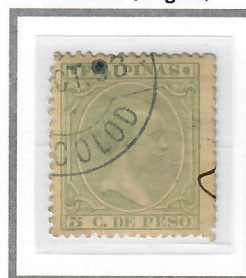
5c Green (1892) Cliché I – Scott #153