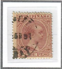
2c Dark Claret (1890) Cliché I – Unlisted