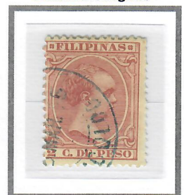
2c Claret (1894) Cliché I – Scott #144