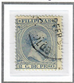
2c Ultramarine (1896) Cliché III – Scott #147