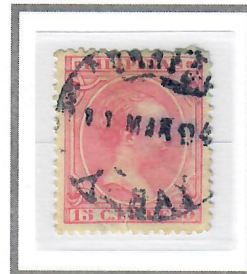
15c Rose (1894) Cliché II – Scott #170