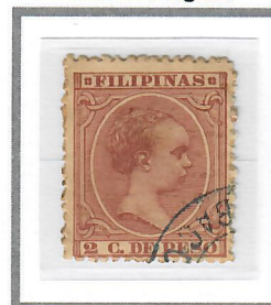
2c Dark Claret (1890) Cliché I – Unlisted