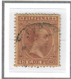
15c Red Brown (1892/44) Cliché II – Scott #169