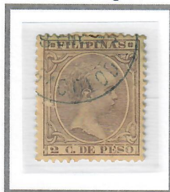
2c Violet (1892) Cliché I – Scott #145