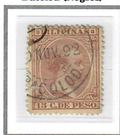
15c Red Brown (1892) Cliché II – Scott #169