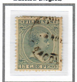
15c Blue Green (1896) Cliché II – Scott #171