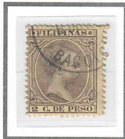
2c Violet (1892) Cliché I – Scott #145