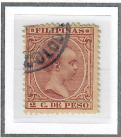
2c Claret (1894) Cliché I – Scott #144