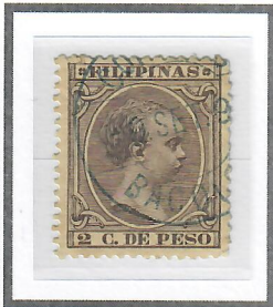
2c Violet (1892) Cliché I – Scott #145