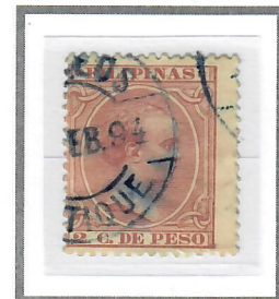
2c Claret (1894) Cliché I – Scott #144