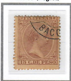
15c Red Brown (1892) Cliché II – Scott #169