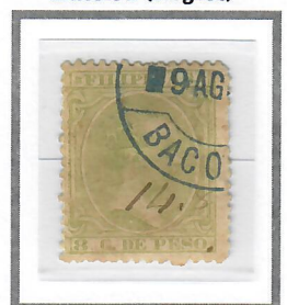
8c Yellow Green (1890) Cliché I – Scott #160