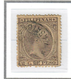
2c Violet (1892) Cliché II – Scott #145