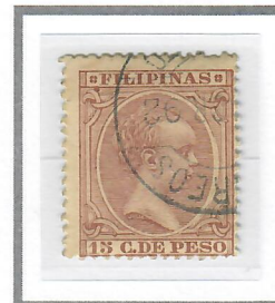
15c Red Brown (1892) Cliché II – Scott #169