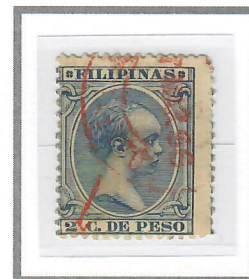
2c Ultramarine (1896) Cliché III – Scott #147