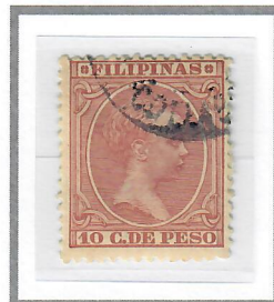
10c Claret (1894) Cliché I – Scott #165