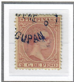
2c Claret (1894) Cliché I – Scott #144