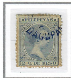
2c Ultramarine (1896) Cliché III – Scott #147