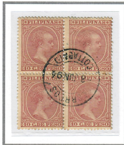
10c Claret (1894) Cliché I – Scott #165