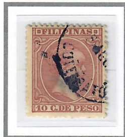
10c Claret (1894) Cliché I – Scott #165