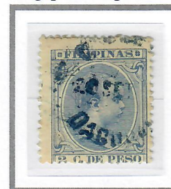
2c Ultramarine (1896) Cliché III – Scott #147