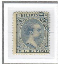
2c Ultramarine (1896) Cliché III – Scott #147