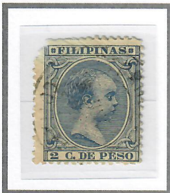
2c Ultramarine (1896) Cliché III – Scott #147