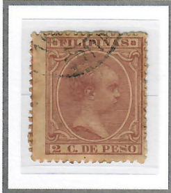
2c Dark Claret (1890) Cliché I – Unlisted