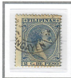
2c Ultramarine (1896) Cliché III – Scott #147