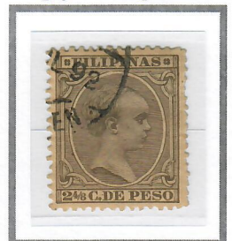
2-4/8c Olive Grey (1892) Cliché I – Scott #150