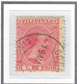
6c Carmine Rose (1896) Cliché II – Scott #159