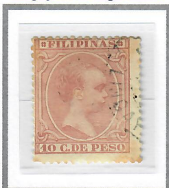
10c Pale Claret (1891) Cliché I – Scott #164