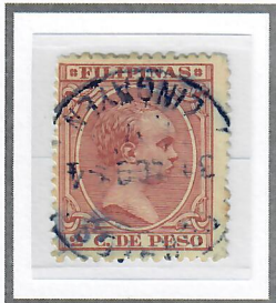
2c Claret (1894) Cliché I – Scott #144