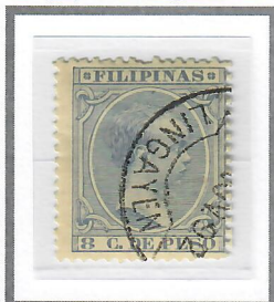
8c Ultramarine (1892) Cliché I – Scott #161