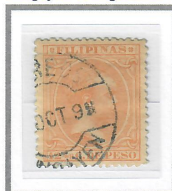
12-4/8c Orange (1892) Cliché I – Scott #168