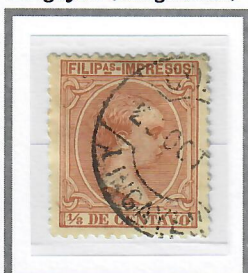
1/8c Orange Brown (1894) Cliché I – Scott #P7