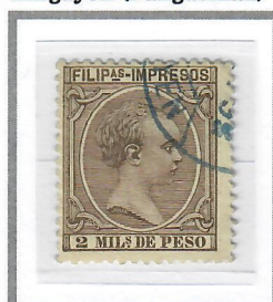
2m Brown (1896) Cliché I – Scott #P16