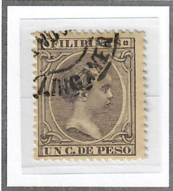
1c Violet (1892) Cliché II – Scott #140