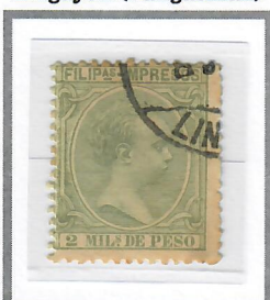
2m Green (1892) Cliché I – Scott #P14