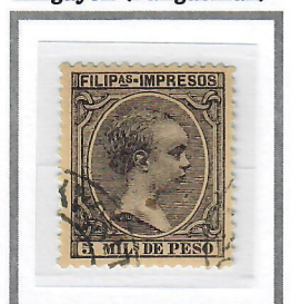
5m Dark Violet (1890) Cliché I – Scott #P17