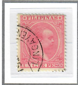
1c Rose (1894) Cliché II – Scott #141