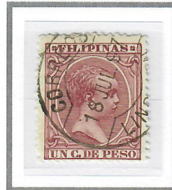
1c Claret (1897) Cliché II – Scott #143