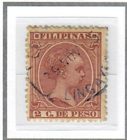
2c Claret (1894) Cliché II – Scott #144