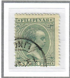
1c Blue Green (1896) Cliché II – Scott #142