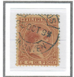
2c Dark Claret (1890) Cliché I – Unlisted