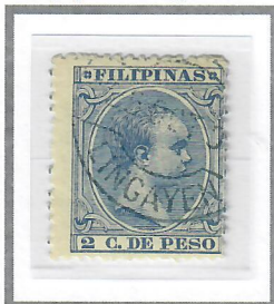
2c Ultramarine (1896) Cliché III – Scott #147