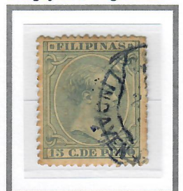
15c Blue Green (1896) Cliché II – Scott #171