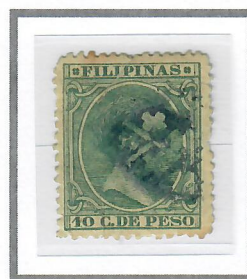
10c Blue Green (1890) Cliché I – Scott #163