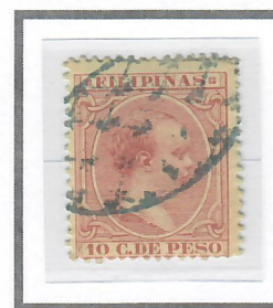
10c Pale Claret (1891) Cliché I – Scott #164