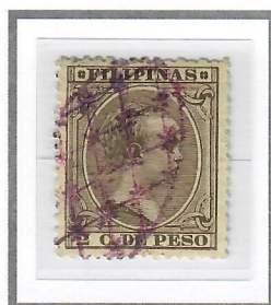
2c Dark Brown (1894) Cliché II – Scott #146