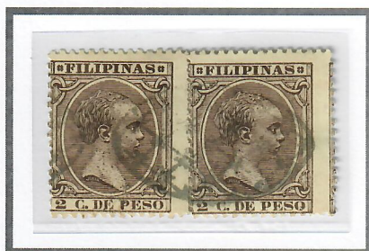
2c Dark Brown (1894) Cliché I – Scott #146