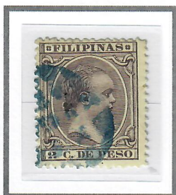
2c Violet (1892) Cliché I – Scott #145