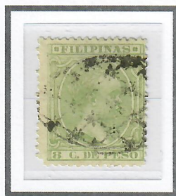
8c Yellow Green (1890) Cliché I – Scott #160