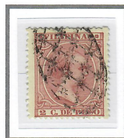
2c Claret (1894) Cliché II – Scott #144