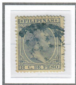
8c Ultramarine (1892) Cliché I – Scott #161