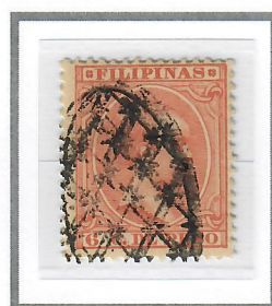
6c Red Orange (1894) Cliché II – Scott #158