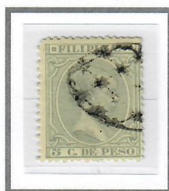
5c Green (1892) Cliché I – Scott #153