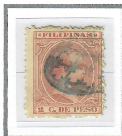
2c Claret (1894) Cliché I – Scott #144