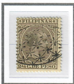
2-4/8c Grey Olive (1892) Cliché I – Scott #150