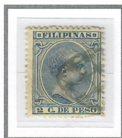
2c Ultramarine (1896) Cliché III – Scott #147