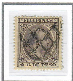
2c Violet (1892) Cliché II – Scott #145