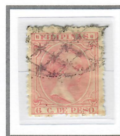
6c Carmine Rose (1896) Cliché II – Scott #159