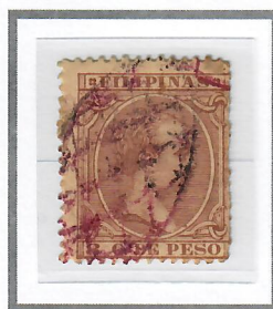
8c Red Brown (1894) Cliché I – Scott #162