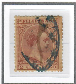
2c Dark Claret (1890) Cliché I – Unlisted