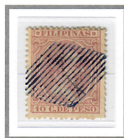
10c Pale Claret (1891) Cliché I – Scott #164