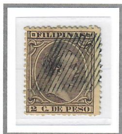
2c Violet (1892) Cliché I – Scott #145