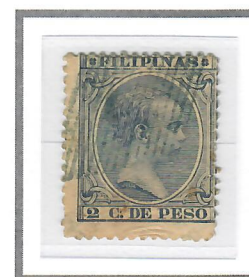
2c Ultramarine (1896) Cliché III – Scott #147