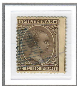
2c Dark Brown (1894) Cliché I – Scott #146