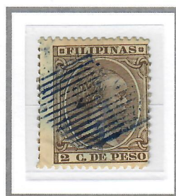
2c Dark Brown (1894) Cliché II – Scott #146