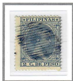
2c Ultramarine (1896) Cliché III – Scott #147