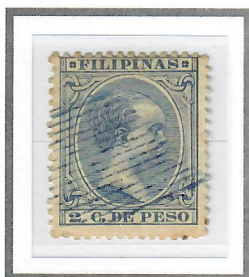
2c Ultramarine (1896) Cliché III – Scott #147