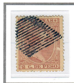
2c Claret (1894) Cliché II – Scott #144