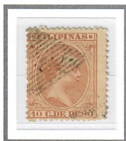
10c Yellow Brown (1896) Cliché III – Scott #166