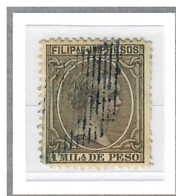
1m Olive Grey (1894) Cliché I – Scott #P11