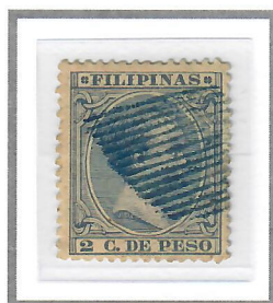
2c Ultramarine (1896) Cliché III – Scott #147