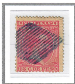
15c Rose (1894) Cliché II – Scott #170