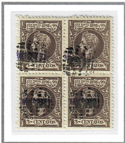
3c Dark Brown