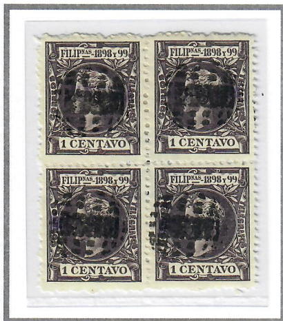
1c Black Violet