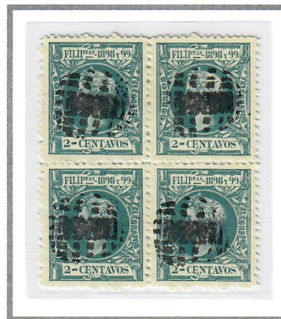
2c Dark Blue Green