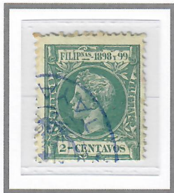
2c Dark Blue Green