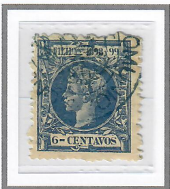
6c Dark Blue