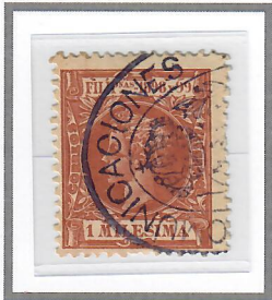
1m Orange Brown