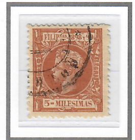
5m Orange Brown