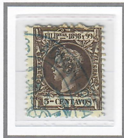
3c Dark Brown