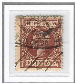
80c Red Brown