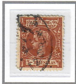
3m Orange Brown