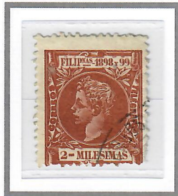
2m Orange Brown