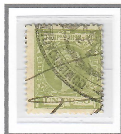
1p Yellow Green