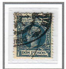
2p Slate Blue