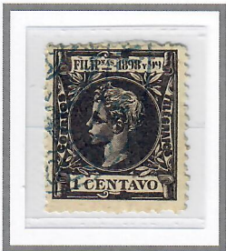
1c Black Violet