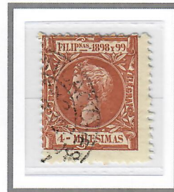
4m Orange Brown