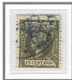
15c Dull Olive Green