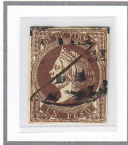
Large 'UN' and Round 'O' in 'PESO'