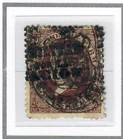
Warren W-42 (on W-37) Horizontal Overprint