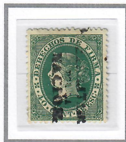
Warren W-41 (on W-36) Vertical Downward