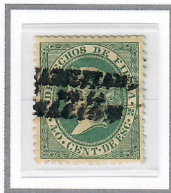
Warren W-41 (on W-36) Horizontal Overprint