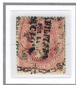
Warren W-43 (on W-38) Vertical Downward