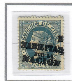
Warren W-44 (on W-39) Horizontal Overprint