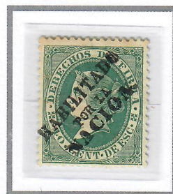
Warren W-41 Reprint Small First 'A'