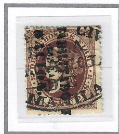
Warren W-42 (on W-37) Vertical Downward