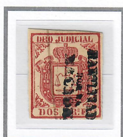
Unlisted in Warren Vertical, Downward