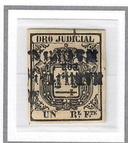
Warren W-85a Inverted Overprint