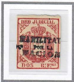
Warren W-86 (on W-11)