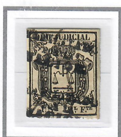
Warren W-85b Overprint Doubled