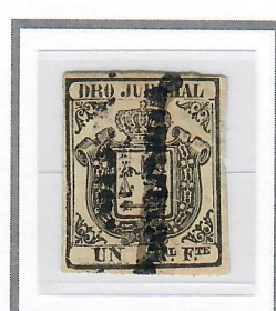
Unlisted in Warren Vertical, Downward