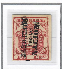
Unlisted in Warren Vertical, Upward