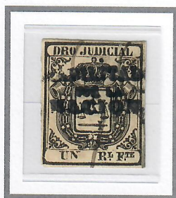
Warren W-85 (on W-6)