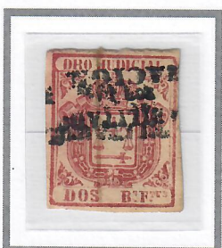
Warren W-86b Double, Inverted