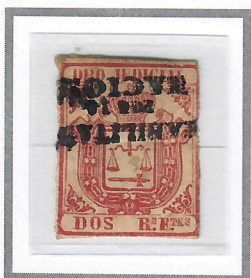
Warren W-86a Inverted Overprint