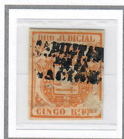
Unlisted in Warren Overprint Doubled

A 1/2r Light Blue issue (W-4) is listed in Warren with the 'Habilitado por la Nacion' Overprint (W-84) but no copies have been seen with this overprint.