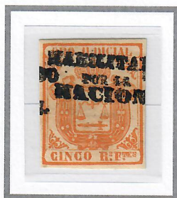
Warren W-87 (on W-13)