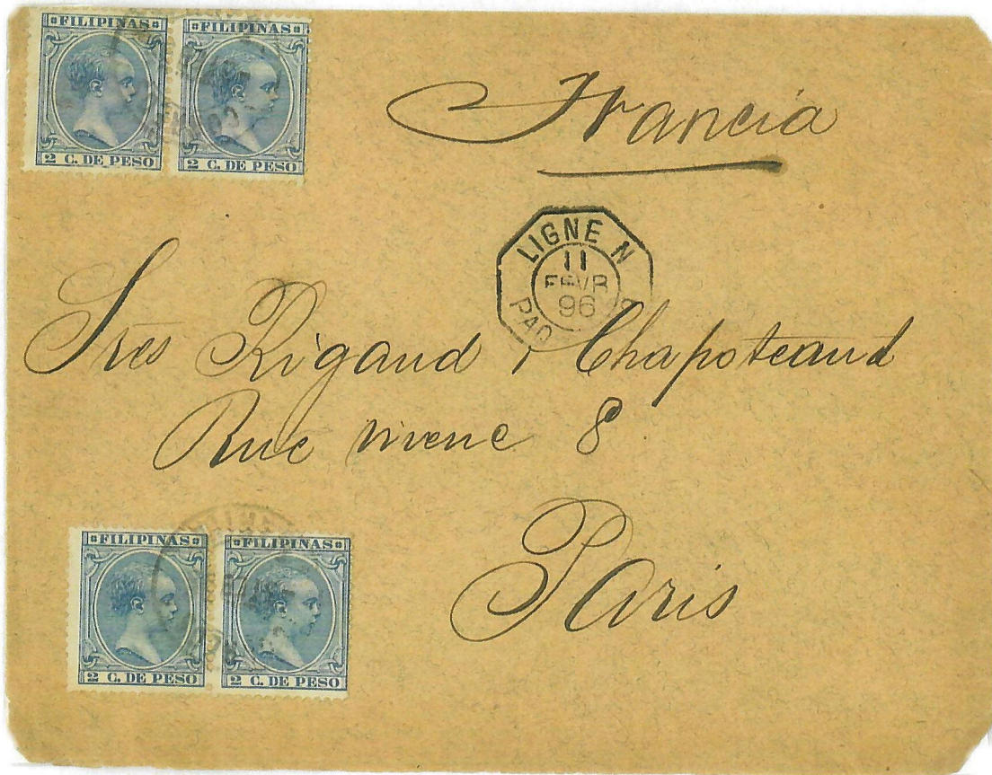
1896 Manila to Paris, France connecting with French paquebot NATAL at Hong Kong at the 8 centavos single-weight overseas rate.