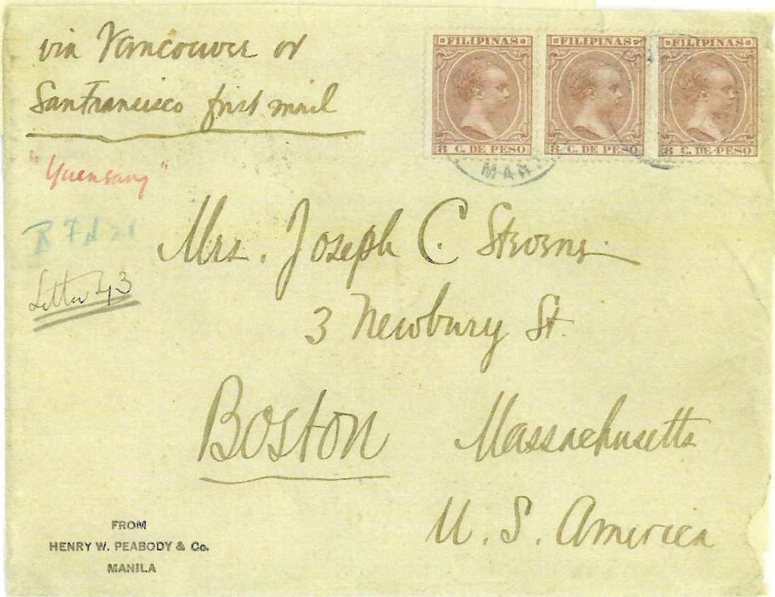
1892 and 1895 Manila to Germany and Boston, respectively.