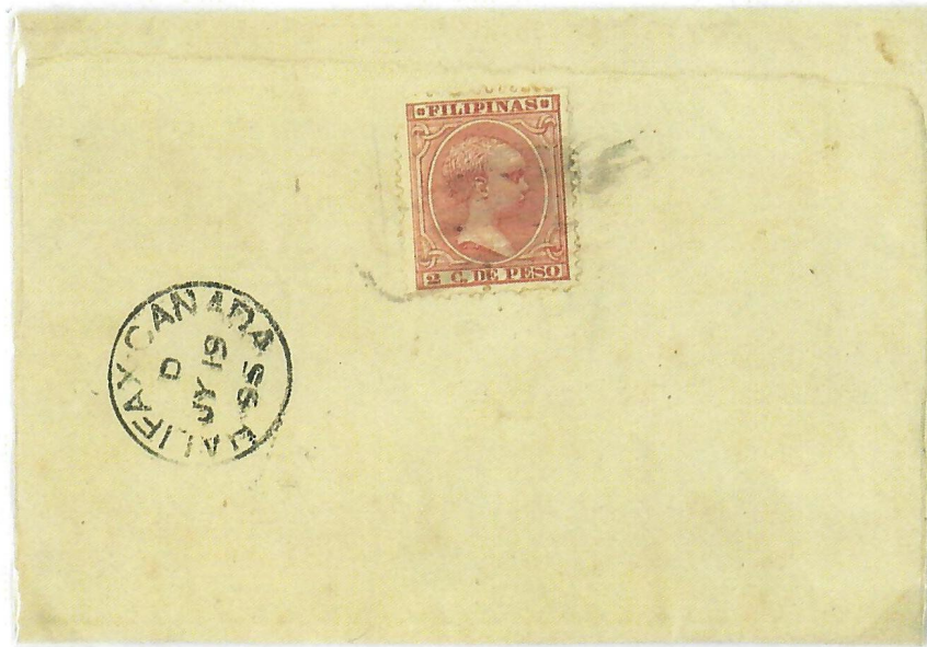
1895 Philippine town to Nova Scotia, Canada newspaper wrapper.