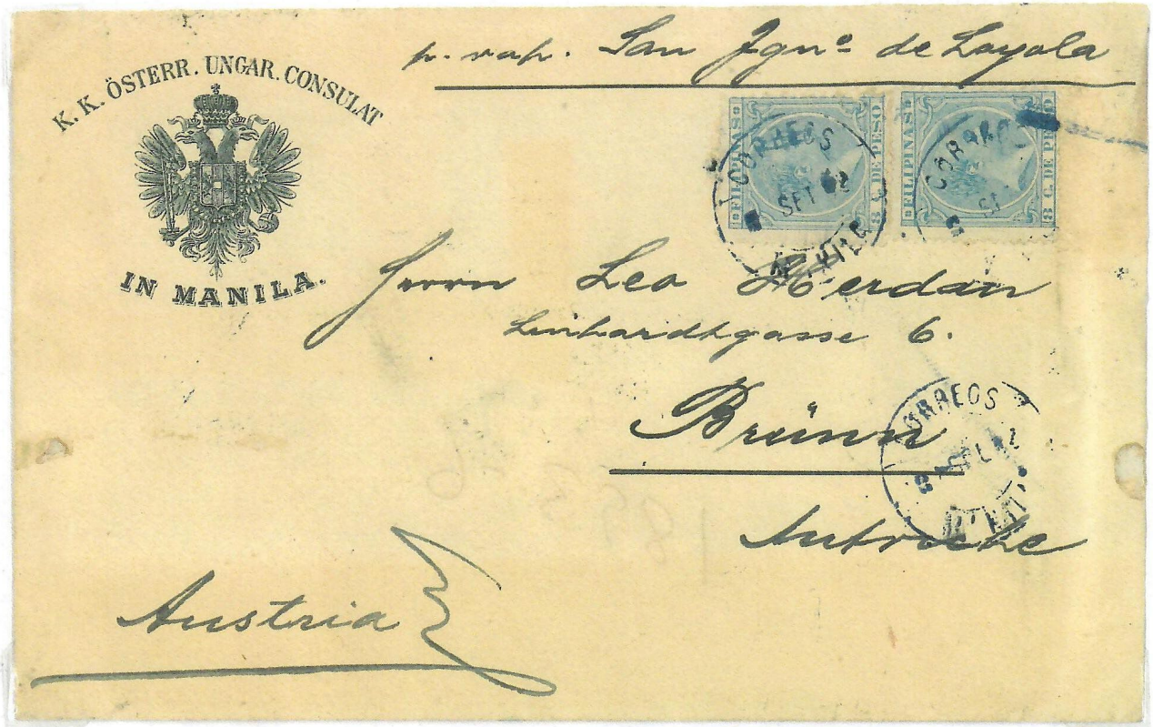
1893 (September) Manila to Brunn (today Brno), Monrovia, Austria-Hungary with Austria-Hungary Consulate corner card. Letter carried by private Spanish ship, SAN IGNACIO DE LOYOLA, via Marseilles, France (cds on reverse).