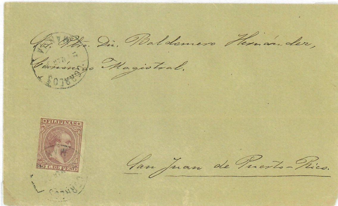
1896 Manila to Puerto Rico.