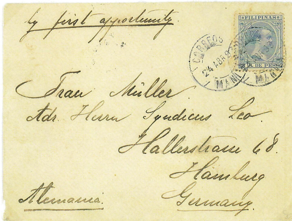
1893 Manila to Hamburg, Germany.