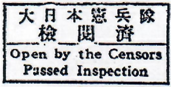
Censor Marking (Garrett IA1)