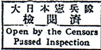
Censor Marking (Garrett IA1)