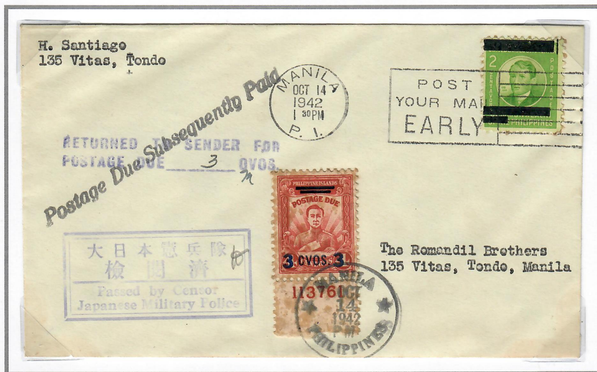
October 14, 1942 (Last Day of Use) – Manila Circulating Cover with incorrect 2c Rate 3c Postage Due affixed to cover shortfall of the 5c First Class Rate