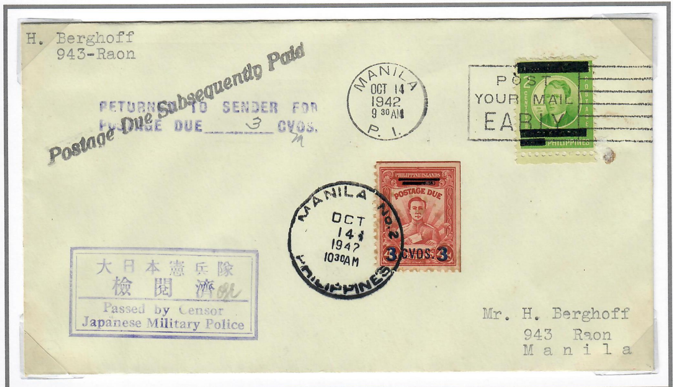
October 14, 1942 (Last Day of Issue) – Manila Circulating Cover with incorrect 2c Rate 3c Postage Due affixed to cover shortfall of the 5c First Class Rate