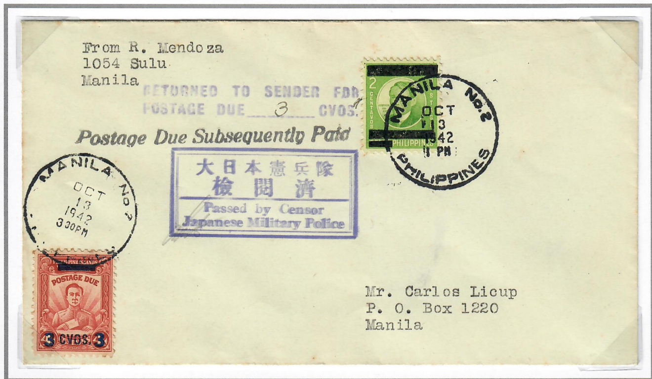
October 13, 1942 – Manila Circulating Cover with incorrect 2c Rate 3c Postage Due affixed to cover shortfall of the 5c First Class Rate

2c Rizal Regular issue cancelled with Manila (No. 2) circular date stamp, postmarked at 1pm, the earliest time reported for any of the October 13 covers. Postage Due stamp applied to pay postage shortfall and cancelled with the same canceller type, postmarked 3:30pm.